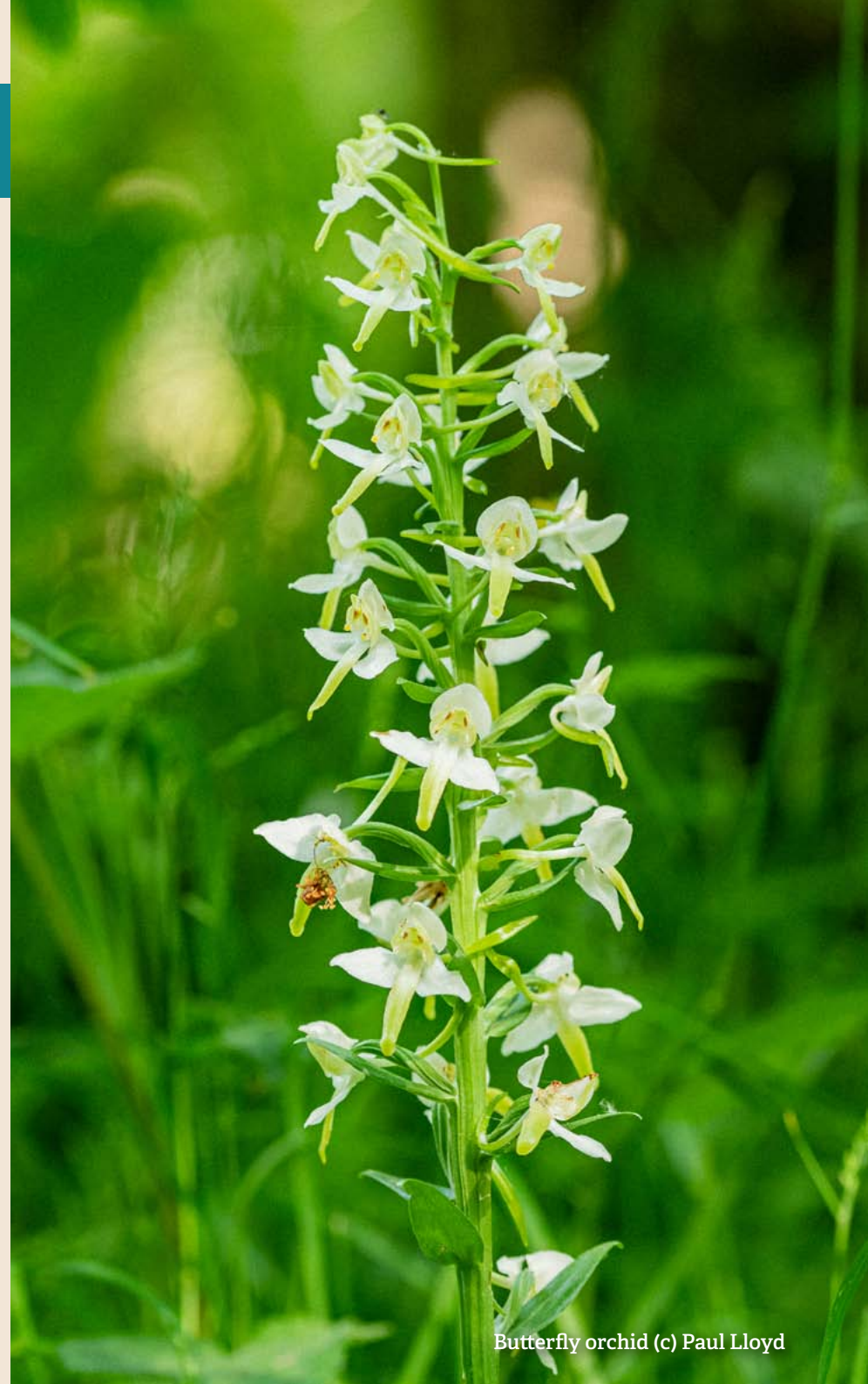
Butterfly orchid

Chief Executive, Herefordshire Wildlife Trust