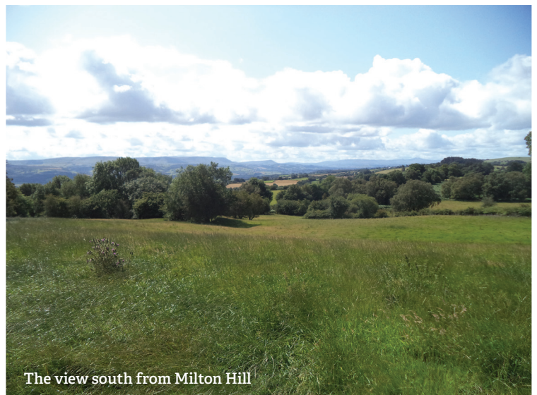
The view south from Milton Hill

straight ahead, initially with a boundary on your right, and then continue on a straight line through a small open field to meet a waymarked stile beside a metal farm gate. At this stile, great views of Vagar Hill (with its distinctive communications tower) and the Black Mountains open up. Follow the direction shown by the stile's waymark, i.e. about 30 degrees off the hedgeline ahead on your left after you cross the stile; as you cross the brow of the field you should see another waymarked stile ahead. Proceed over the stile and into a short, overgrown section to reach another waymarked stile with a clear path ahead that runs parallel to the contours to reach a double waymarked stile (Point 14); Yazor Wood and Burton Hill stand out as wooded slopes on the horizon straight ahead. Keep straight on to a distant waymarked stile into Cwm Thomas Wood. Cross the steep-sided, wooded dingle and emerge into a field via a waymarked stile. Follow the waymark towards Brilley church tower; there may be a clearly visible path through the crop field. Cross over double waymarked stiles and follow the waymark to a pair of metal farm gates in the far right hand corner of the next field. Through the gates, keep the churchyard hedgerow close on your right through the last field to access the surfaced lane through a metal farm gate. Turn right on the lane to return to the start in a short distance.