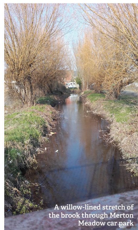
A willow-lined stretch of the brook through Merton Meadow car park

This area is part of the Edgar Street Grid and is scheduled for redevelopment. The extent to which you can explore the Brook here will depend on what form the redevelopment takes and how far it has progressed when you visit. You may be able to view a short willow-lined section of the Brook which is pleasantly incongruous amidst acres of tarmac ( point 6 ); you may also be able to view the Brook as it flows close to the back of a large brick building that started life after the 1930s as a pub. A