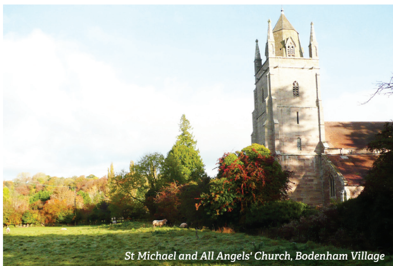
St Michael and All Angels' Church, Bodenham Village

After crossing the footbridge there is another optional spur walk to the right, along the left bank of the River Lugg and back, watching for wildlife in this peaceful location.