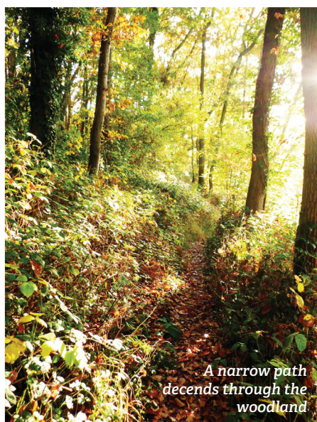
A narrow path descends through the woodland

into open fields, with a line of young oaks on the right. At the gate by the cattle grid in front of farm buildings ( point 2 ) you should branch right off the Wyche Way and across the field, passing to the right of two distinctive circular plantations. The second plantation and field boundary funnel you towards a wooden stile ahead (the only one on this walk), which you should cross into woodland. Descend the woodland path to reach a short flight of steps and a waymarker at which you should turn left and soon afterwards fork right, continuing downhill along the path. Please note, this path is narrow and fairly steep.