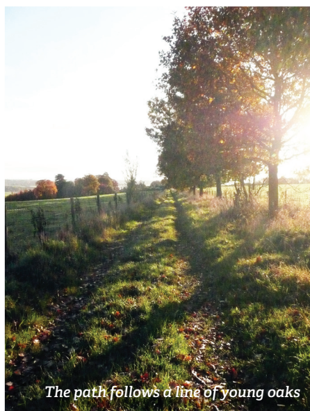
The path follows a line of young oaks

into open fields, with a line of young oaks on the right. At the gate by the cattle grid in front of farm buildings ( point 2 ) you should branch right off the Wyche Way and across the field, passing to the right of two distinctive circular plantations. The second plantation and field boundary funnel you towards a wooden stile ahead (the only one on this walk), which you should cross into woodland. Descend the woodland path to reach a short flight of steps and a waymarker at which you should turn left and soon afterwards fork right, continuing downhill along the path. Please note, this path is narrow and fairly steep.