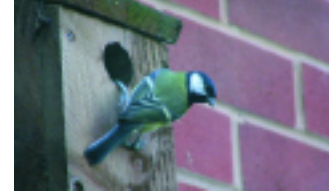
Blue tit

What's more, building bird boxes is straightforward and easy - no special carpentry skills are needed.