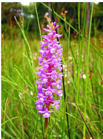
Fragrant Orchid (Chris Harris)

The wet central part of the reserve has probably been a marsh for over 150 years, as the area was known as "the Moors" (i.e. marsh/fen) at the time of the 1844 Tithe map, although the official description referred to pasture. Since that time there has been much woodland encroachment, and the present-day marsh, now surrounded by farm pasture, is the only surviving fragment of a once much larger wetland area. Situated on the edge of the central Hereford plain, the ground is poorly drained, and remains permanently water-logged thanks to several lime-rich flushes, plus a stream which flows into the reserve from the nearby sandstone ridge to the north. The fringing woodland around the marsh is dominated by Alder coppice in the wetter margins, while well-grown Ash and Oak with some Hazel understorey feature in the wooded areas in the north of the reserve.